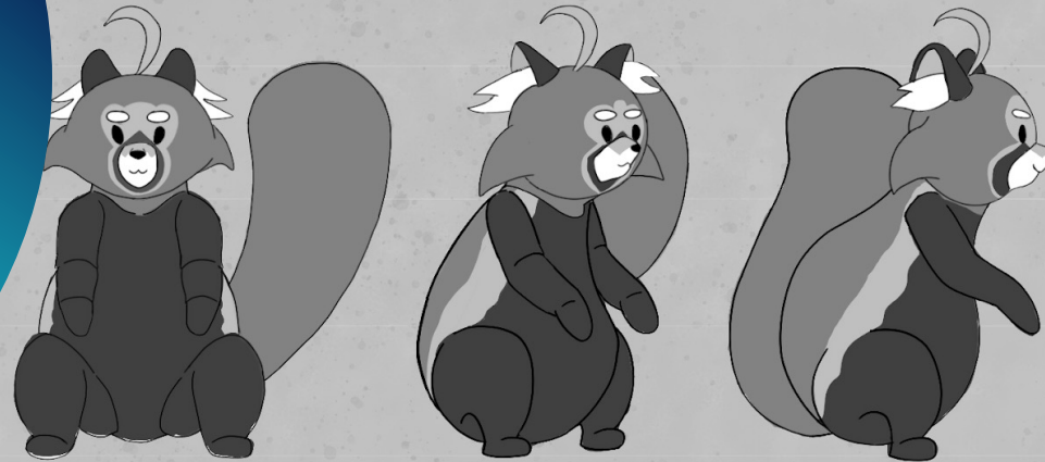
RED PANDA TURNAROUND